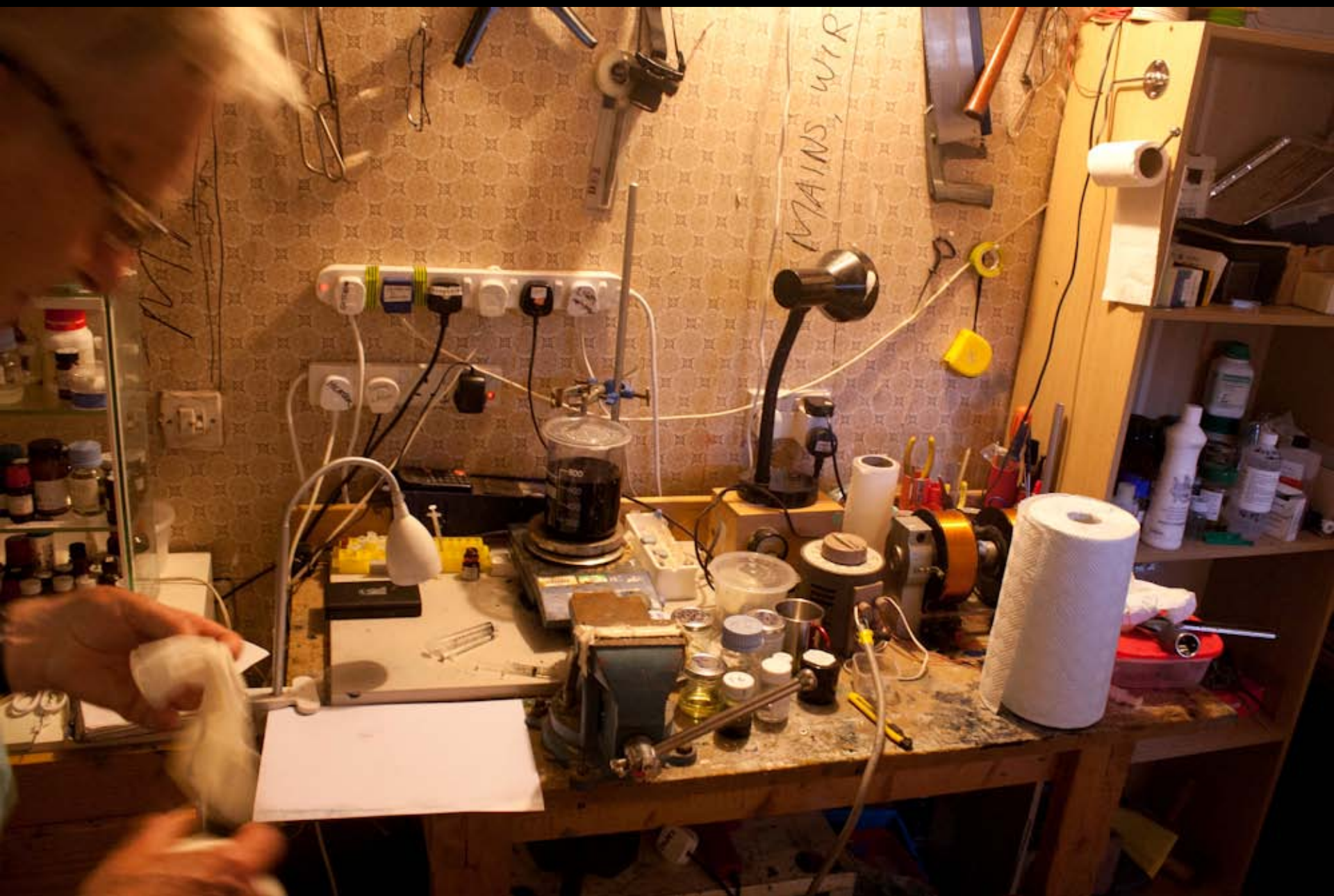
Jeff's basement workshop