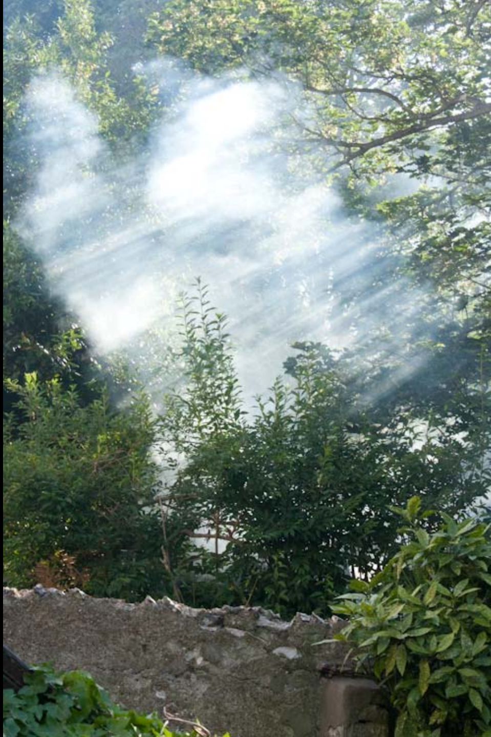
Smoke from somebody down the block's barbecue