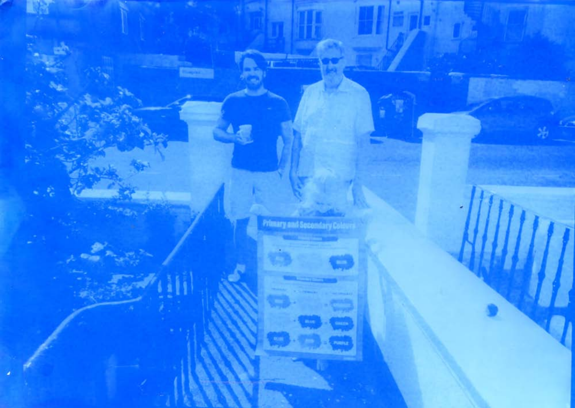
The fruits of the labor: a direct positive cyanotype process, the Blythtype!